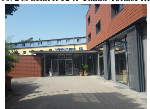
12. Youth Hostel main entrance