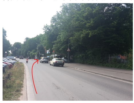
10. From bus stop to entrance