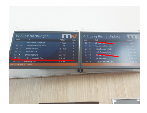
04. Time table at north exit