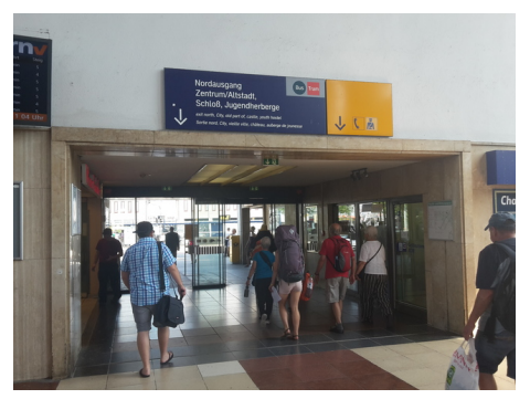
03. North exit