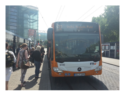
08. Bus number 32 to Unikl.Neuenh.Feld