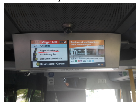
09. Next stops display in bus