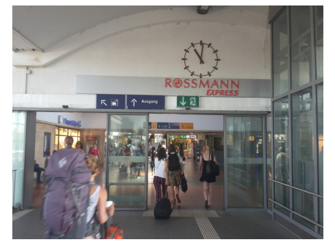
01. Bridge above platforms to main station hall