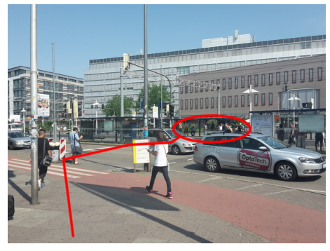
05. The bus stop from across the road