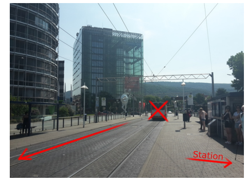
06. View from where the bus will come