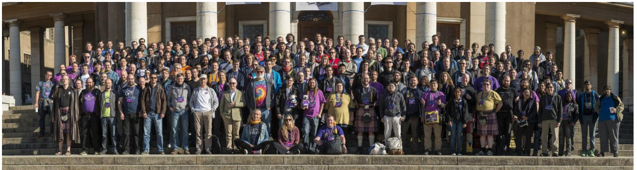
DebConf attendees at DebConf16 in Cape Town, South Africa