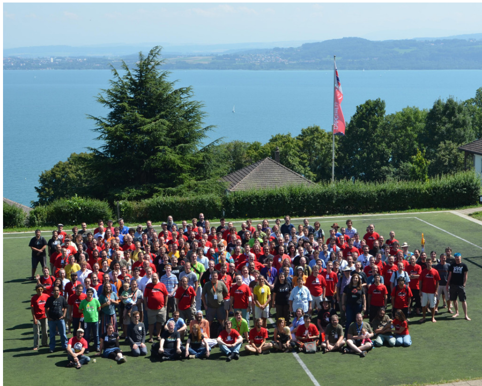
DebConf13 Attendees in Vaumarcus, Switzerland