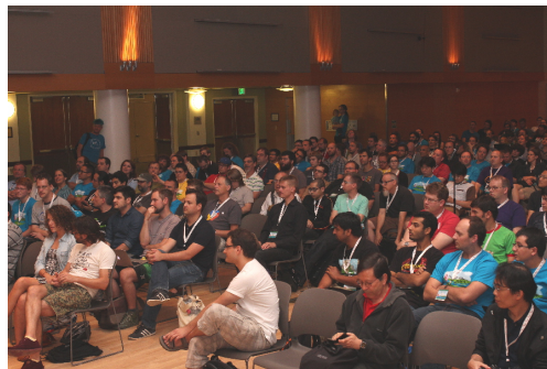
Attendees in a plenary session at DebConf14

Thanks to our sponsors, participation, accommodation, and meals are free of charge for qualifying Debian developers and contributors who apply for bursaries. In addition, a limited amount of travel cost subsidies are available, to bring contributors who would not otherwise be able to attend. The organisation of DebConf itself is entirely volunteer-based.