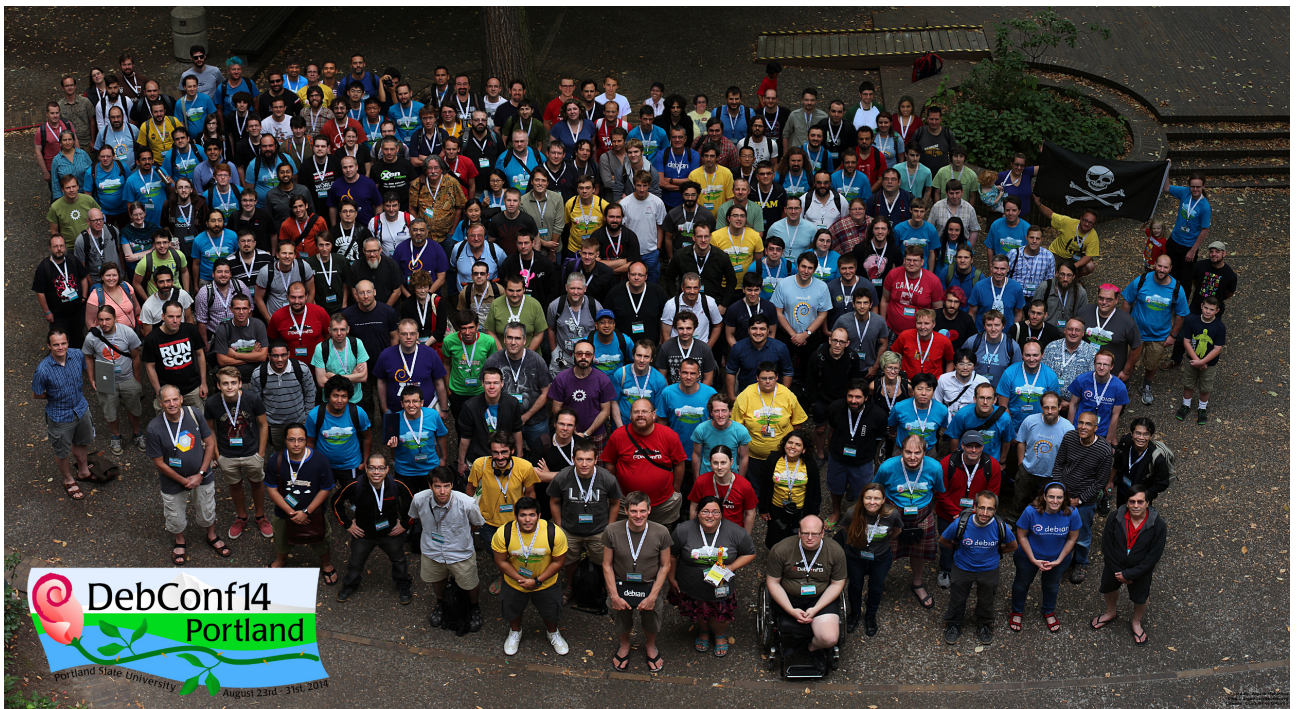
DebConf attendees at DebConf14 in Portland, Oregon, USA