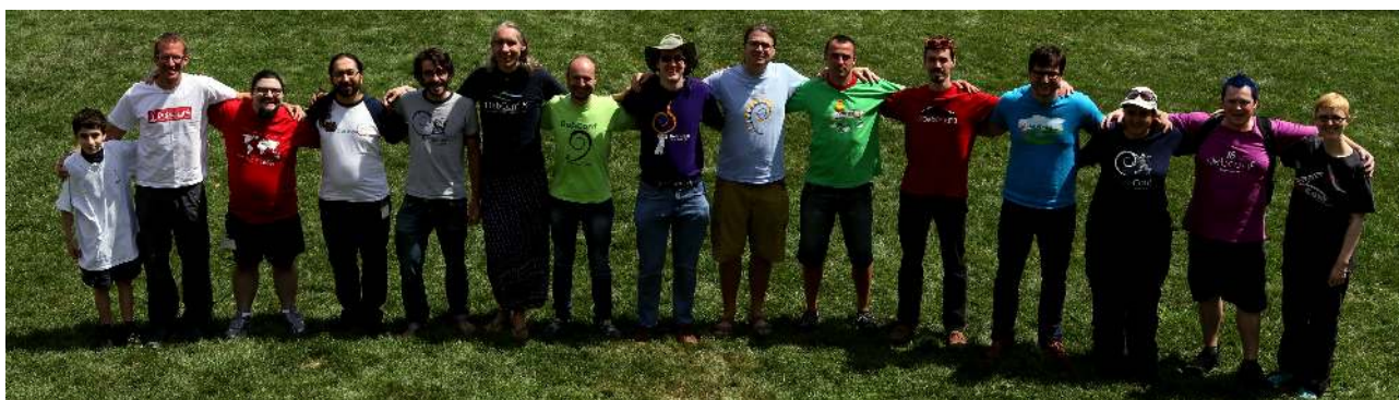
Participants with T-Shirts from past DebConf

a Space for kiosks is limited during Job Fair. First come, first served.