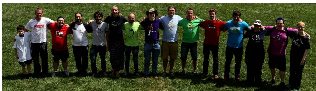
Participants with T-Shirts from past DebConf

a Space for kiosks is limited during Job Fair. First come, first served.