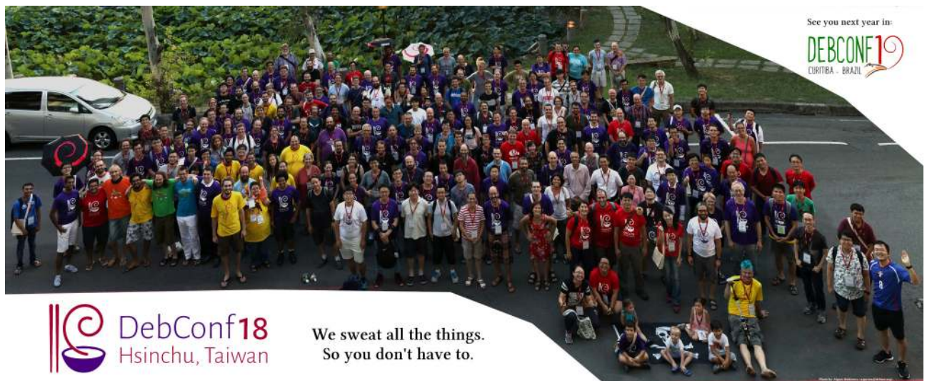
DebConf attendees at DebConf18 in Hsinchu, Taiwan