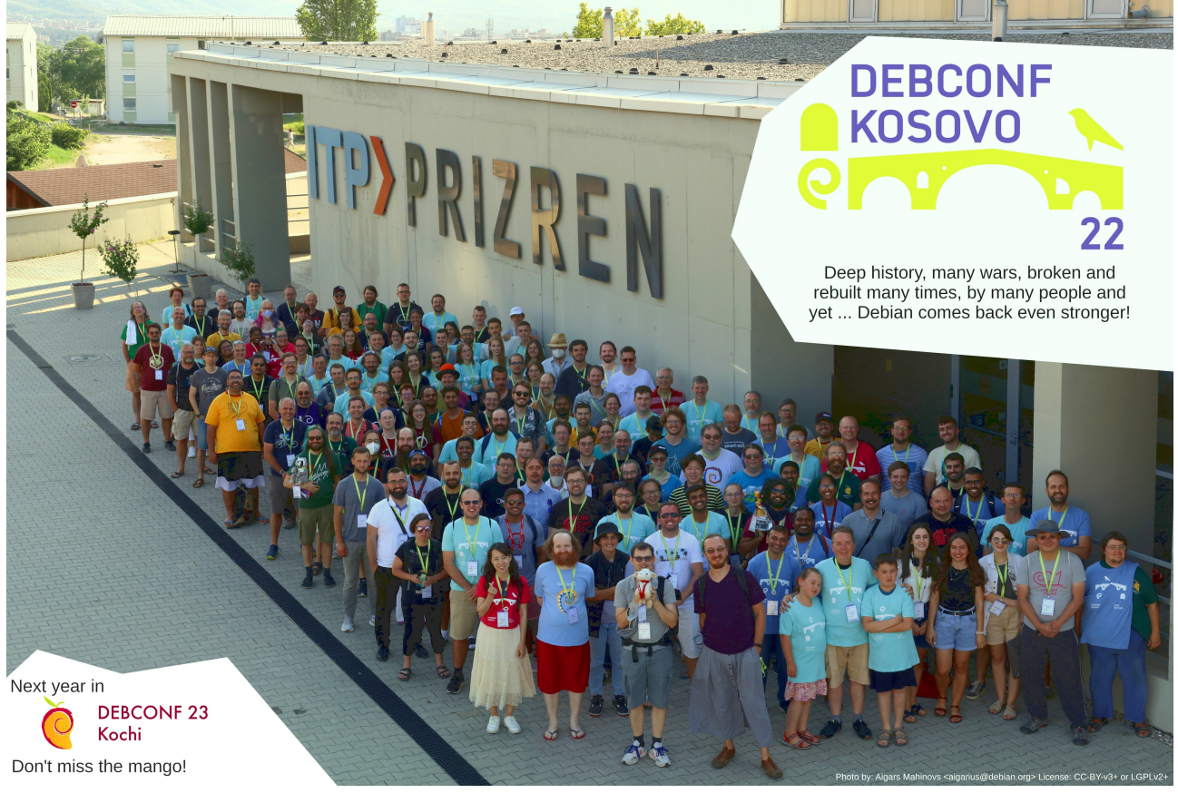
DebConf attendees at DebConf22 in Prizren, Kosovo